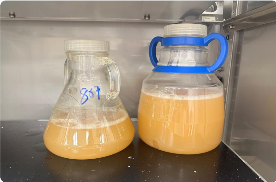
2.5L (final volume)

Transient CHO/Stable CHO, HEK293, Insect Cells