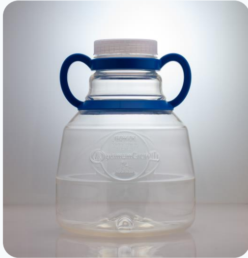
Optimum Growth® 7L Flask Scale Consistently Across All Sizes # 931117