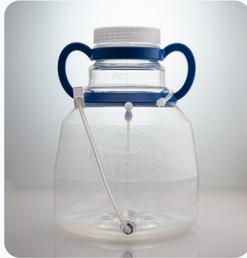
Direct Fill to Bioreactors Optimum Growth® 7L Multiport Flask 2' of ID 1/8" Transfer Tubing & Sampling Port # 931117-55-18