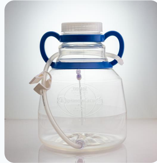
Direct Fill to Bioreactors Optimum Growth® 7L Multiport Flask 2' of ID 1/4" Transfer Tubing & Sampling Port # 931117-55-14