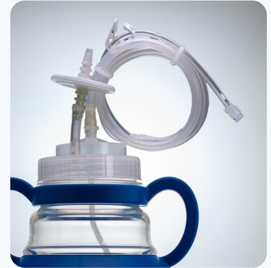
Bidirectional Transfer Cap For Optimum Growth® 7L Flask # 931470-8

Thomson 7L: 50% volume+ more than other shake flasks, and can grow up to 30L/Shaker (eliminates bags)