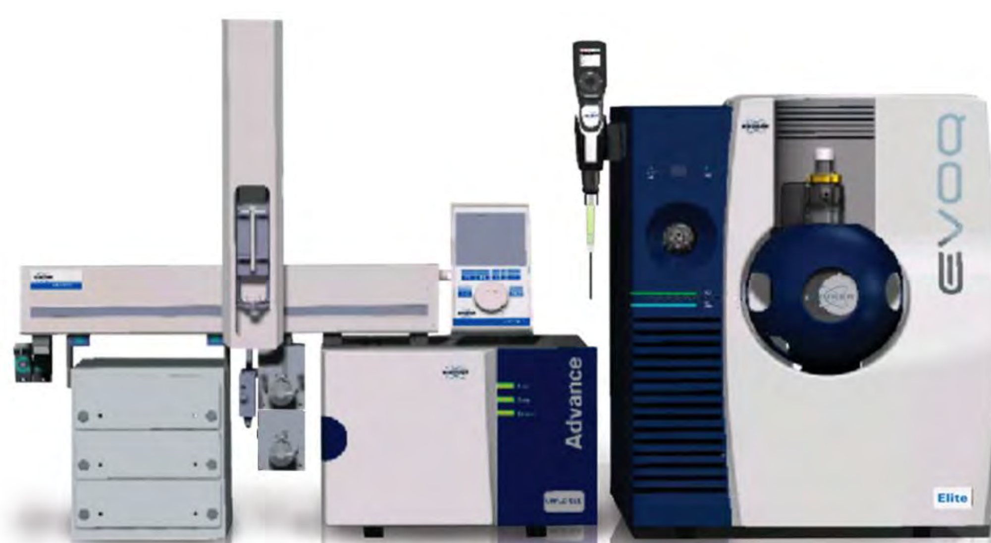
Fig. 1 EVOQ Elite triple quadrupole mass spectrometer coupled to a Bruker integrated On-Line Extraction-UHPLC and CTC Autosampler

Solid Phase Extraction (SPE) is widely used for sample clean up before LC-MS/MS analysis. It is costly and time consuming. Here we present a high throughput, cost effective and sensitive procedure for screening and confirmation of Pain Panel Drugs (PPDs) in Synthetic Saliva using Thomson filter vial for sample preparation and using an integrated On-Line Extraction (OLE)-UHPLC-MS/MS System for sample analysis. The lower limit of quantitation (LLOQ) was 0.01-0.2 ng/mL and upper limit of quantitation (ULOQ) was 100 ng/mL. The linearity regression coefficient R^2 was >0.99 . The blanks show no interference of the analysis at the LLOQ level. The sub ng/mL level PPDs detection with about three orders of dynamic detection range will cover the clinical research needs.