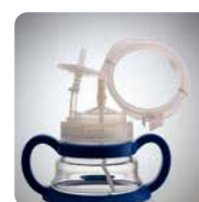
Transfer Cap 931470-8